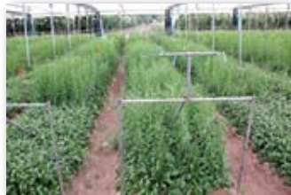
Operating a research greenhouse