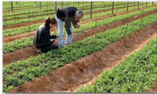
Monitoring growing parameters