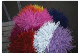
Colored Green Bells