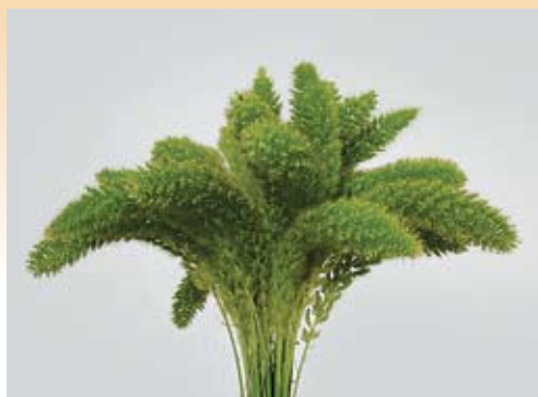
Setaria Volle Melk